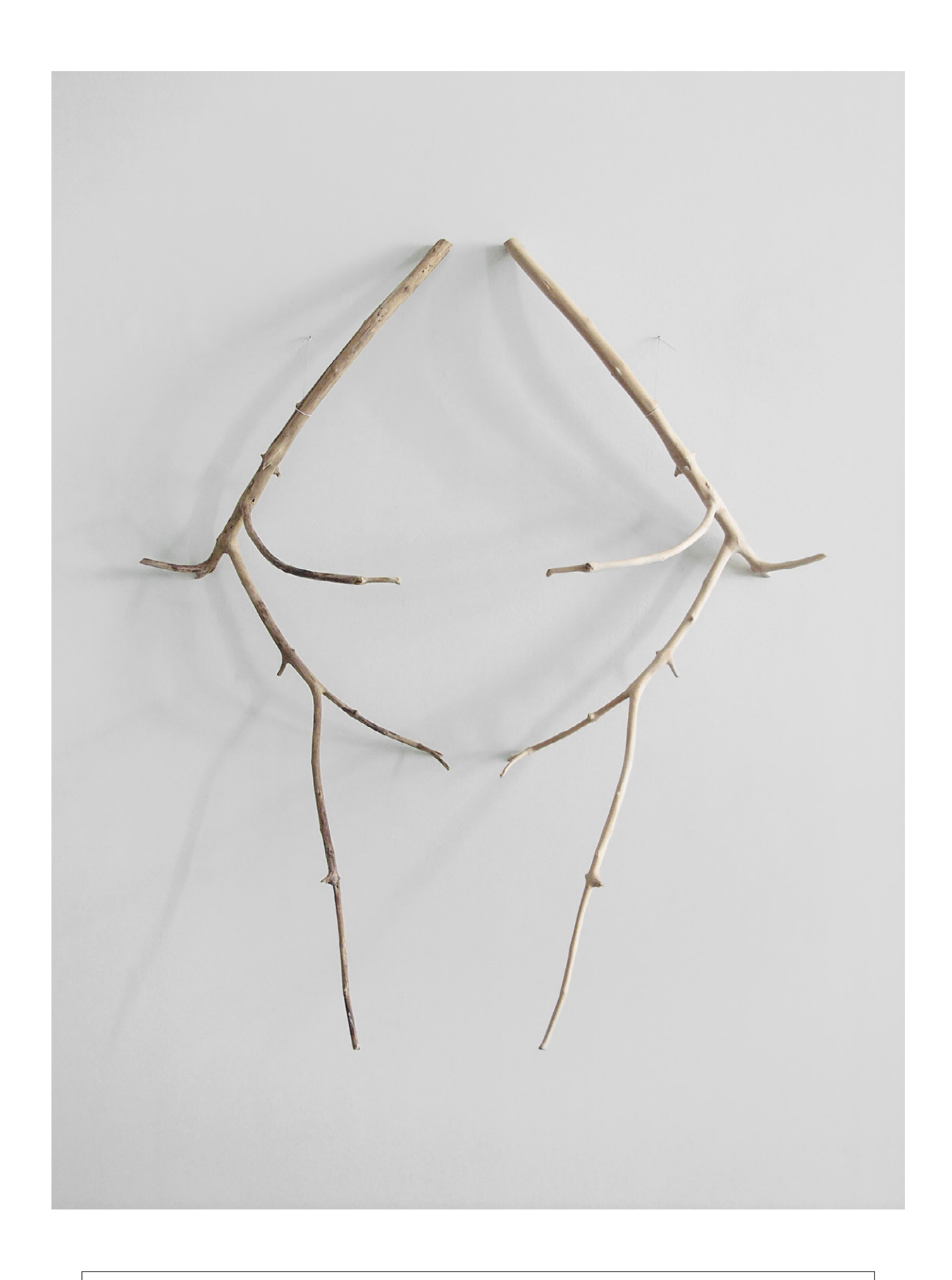
o.T. (Rorschach Test), 2009 found Elder branch, Lime wood carved and sanded; 110 x 100 x 30 cm