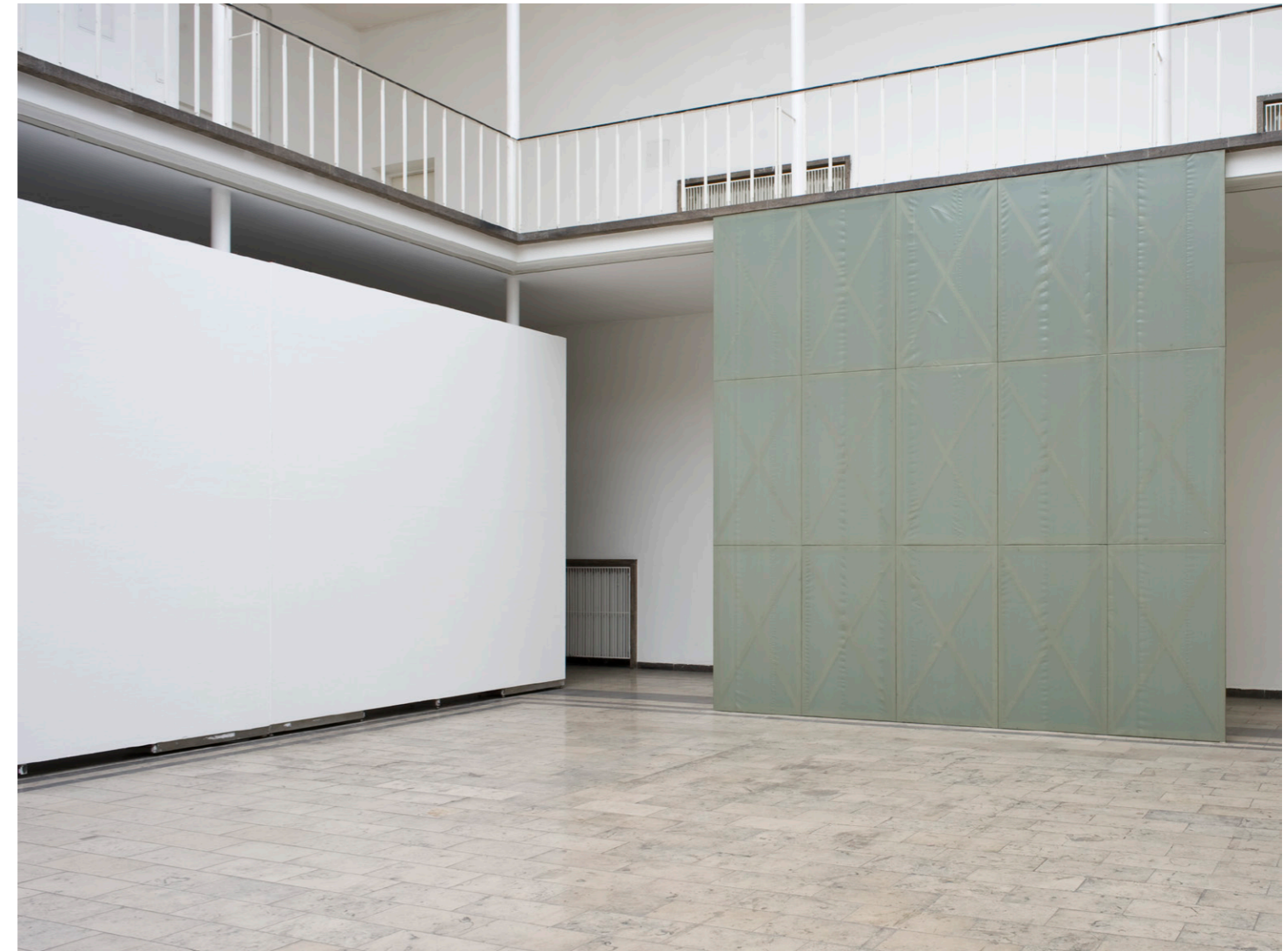
Installation view of the Debütantenausstellung at the Academy of Fine Arts Karlsruhe

Lightning Structure, 2010 aluminium, 400W HQI spot lights; 3,00 x 1,70 x 0,56 m