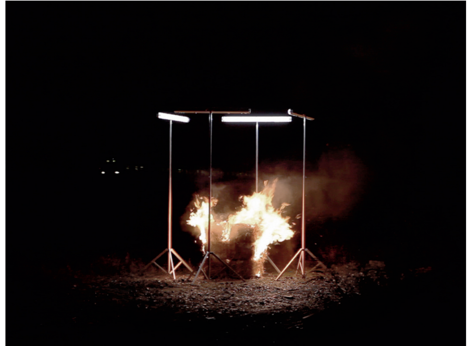
The Votive Square Fire (Videostill), 2013 a videoset for a postarchaic custom; self constructed aluminium telescope tripods, neon tubes, electr. components, six bale of straw; soundtrack by Joe Lally (ex-Fugazi) Video 15'50"