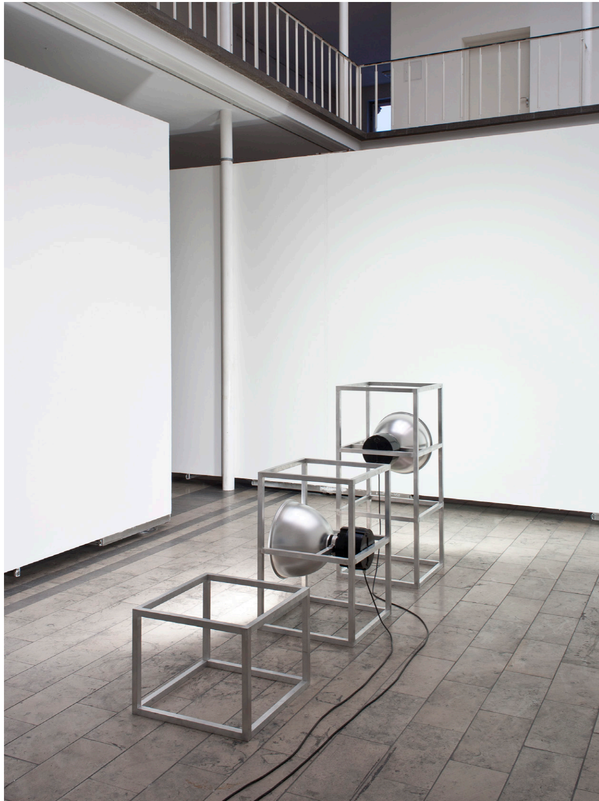
Installation view of the Debütantenausstellung at the Academy of Fine Arts Karlsruhe

Lightning Structure, 2010 aluminium, 400W HQI spot lights; 3,00 x 1,70 x 0,56 m